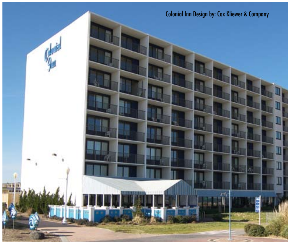
Colonial Inn Design by: Cox Klierer & Company