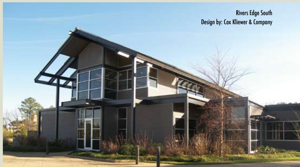
Rivers Edge South Design by: Cox Kliewer & Company