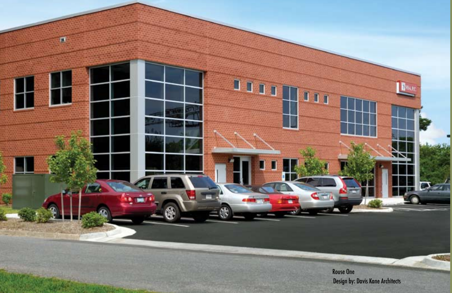
Rouse One Design by: Davis Kane Architects