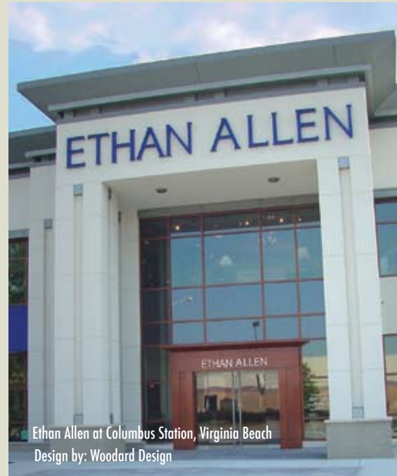
Ethan Allen at Columbus Station, Virginia Beach