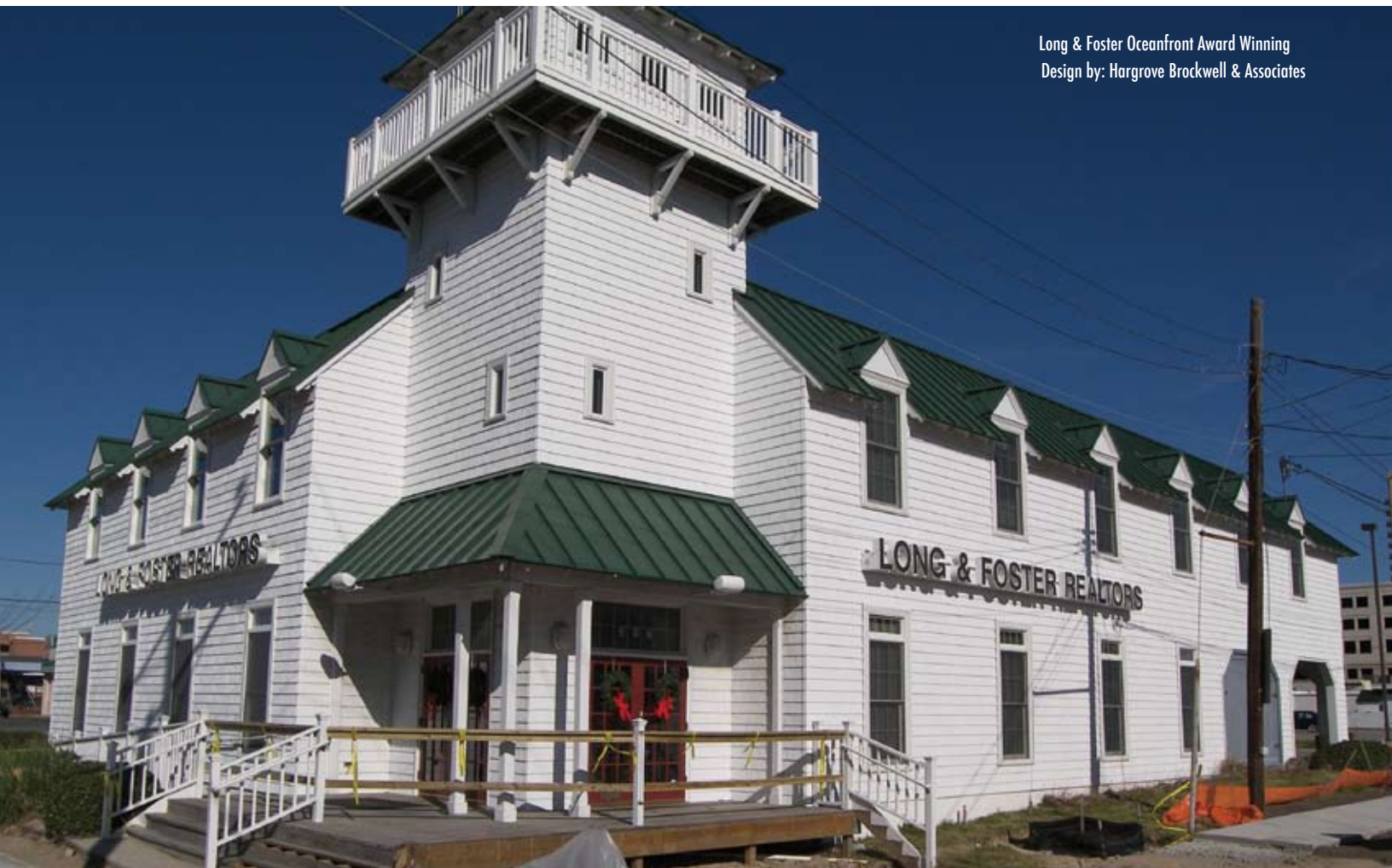
Long & Foster Oceanfront Award Winning Design by: Hargrove Brockwell & Associates