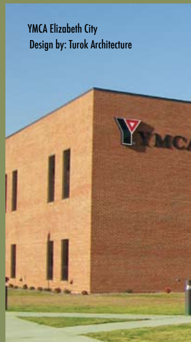
YMCA Elizabeth City Design by: Turok Architecture